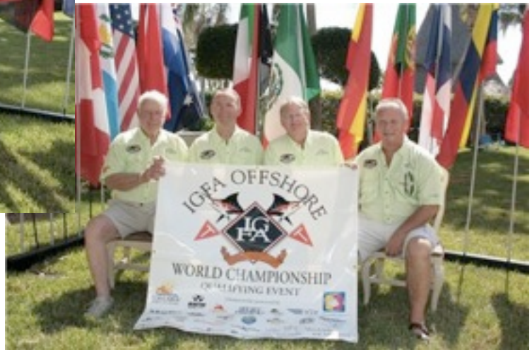
Cabo San Lucas, Mexico

Top anglers from around the globe met in Cabo San Lucas to compete in the 10th annual IGFA Offshore World Championship on November 9-13, 2009.